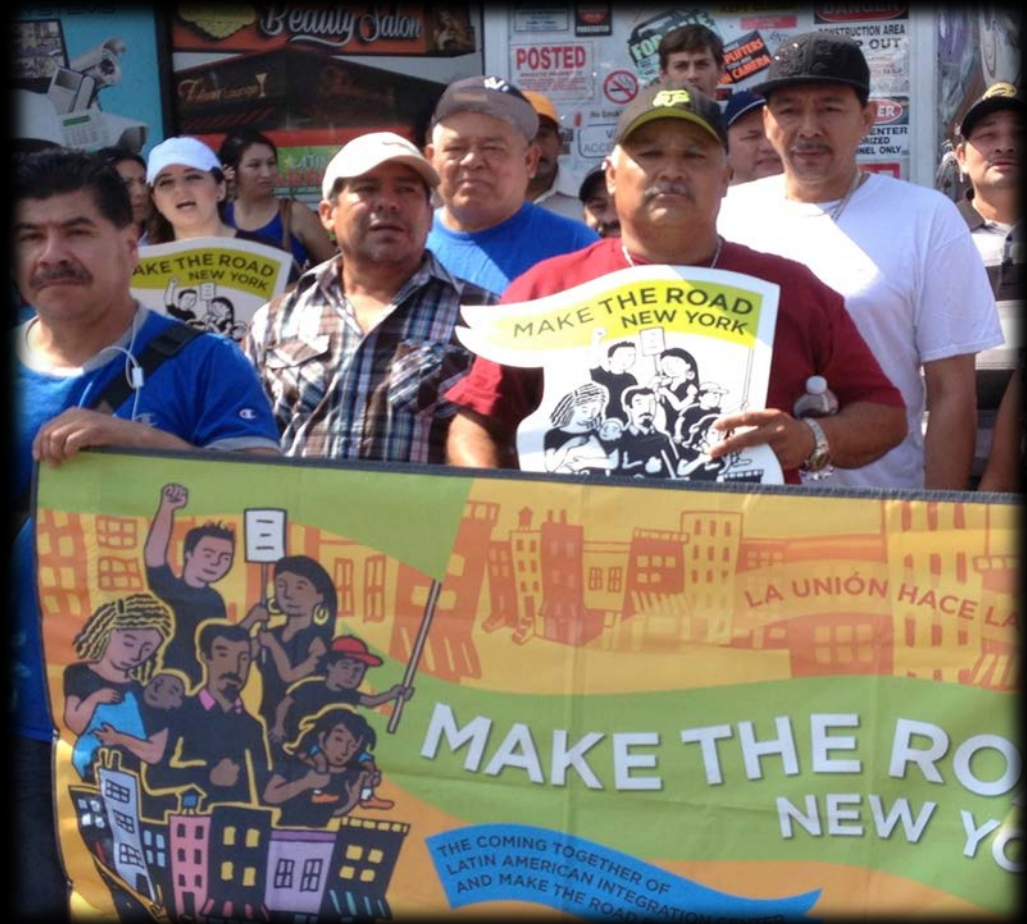
car wash picket line