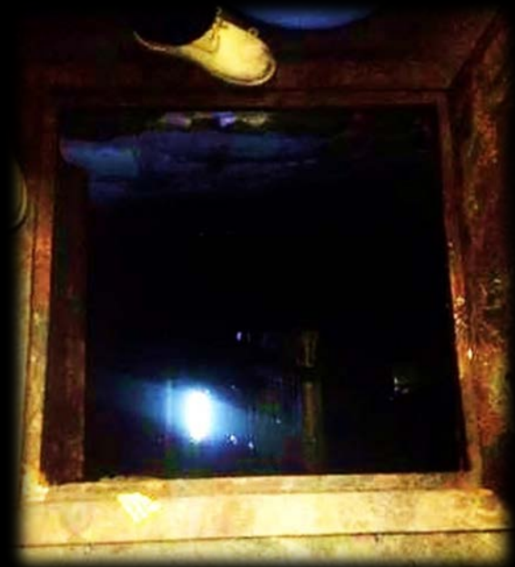
cistern: confined space