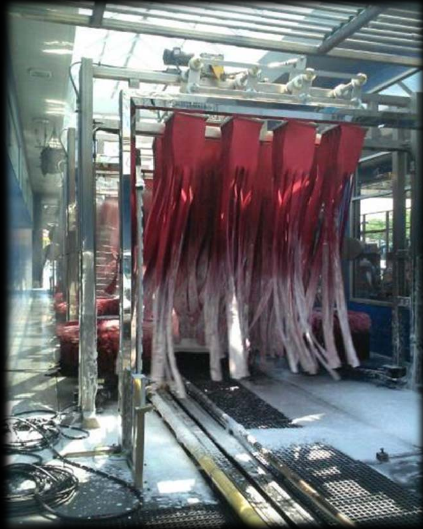
Car wash Machinery