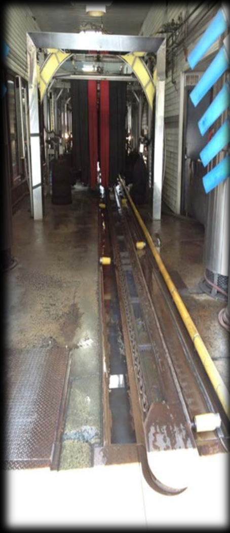
water collection canal