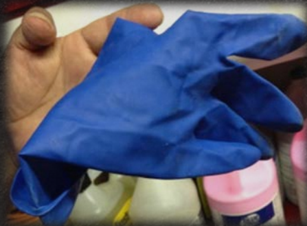
Improper PPE for their work