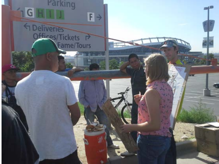
Workers engaged in chemical exposure training