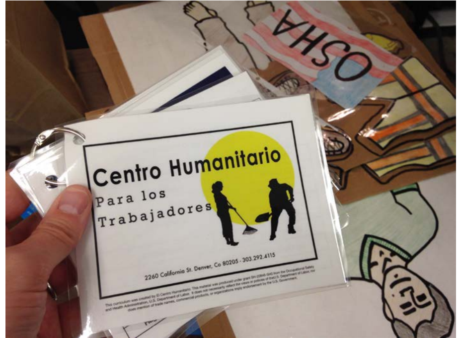
Quick Guides For Workers