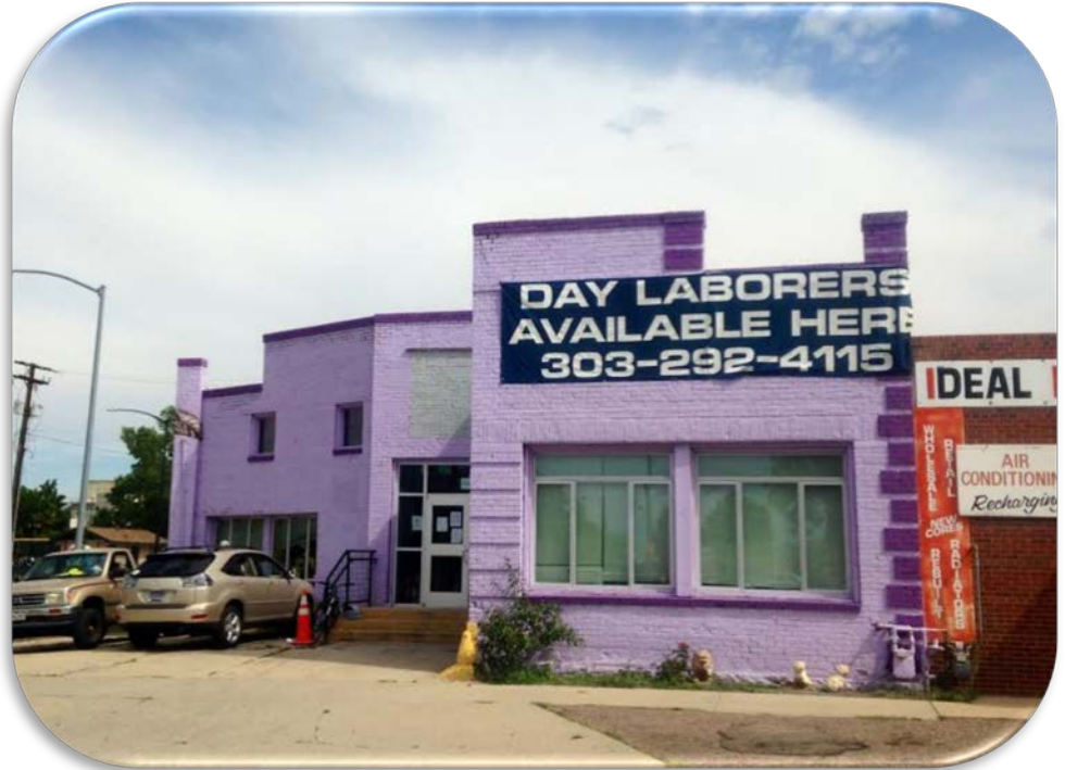
Centro Humanitario Para Los Trabajadores