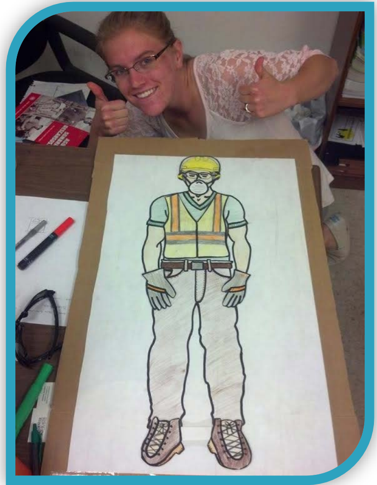
PPE Man Activity for Trainings