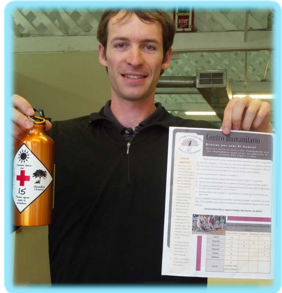
Our giveback stickers and employer pamphlets